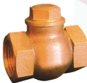
ITEM CODE # GM - 508

Screwed in bonnet, Integral seat, Guided Plug type disc.