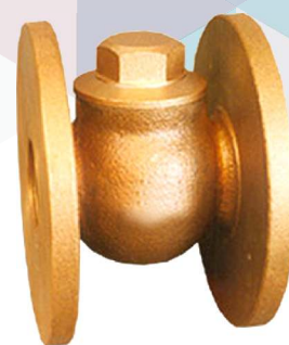
ITEM CODE # GM - 509